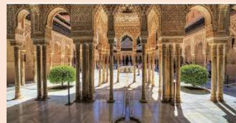
La Alhambra (Granada)